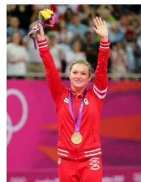
Rosannagh MacLennan poses after winning Gold at the London 2012 Olympic Games (Russell, 2012).